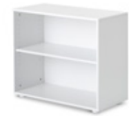
Bookcase with 1 shelf H:63,2 W:72 D:34,5