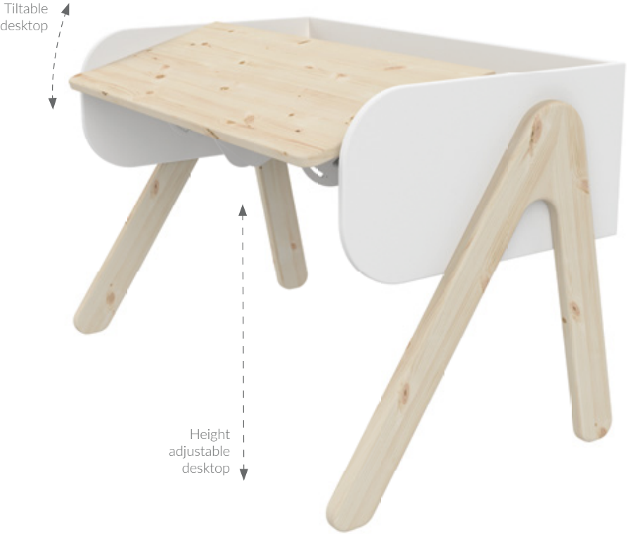
WOODY study desk