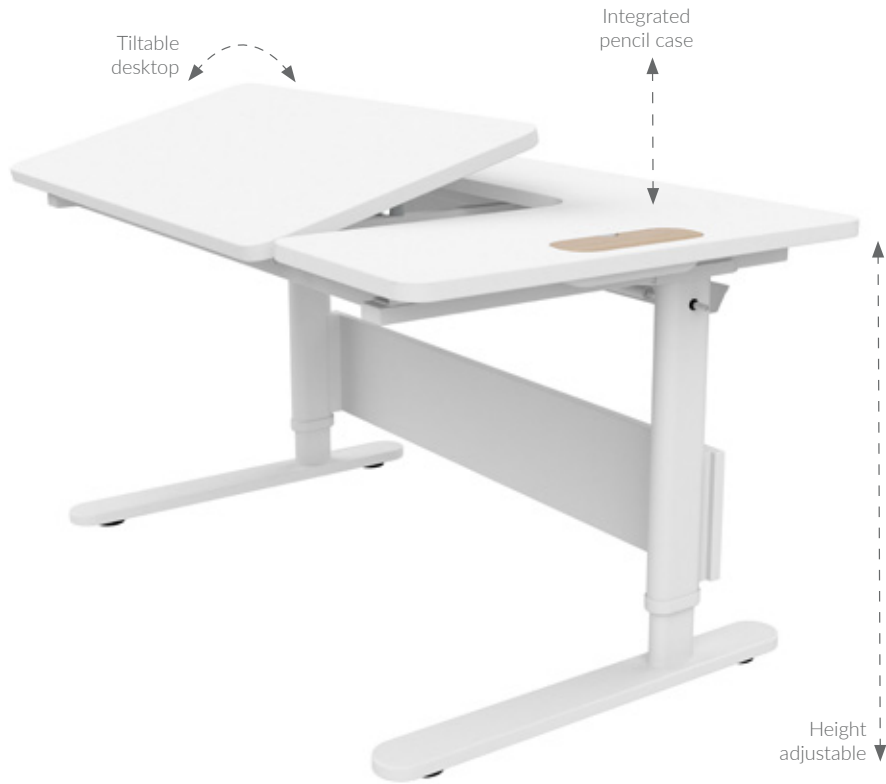
Moby-left up H:59-83 W:120 D:70 / 82-50149