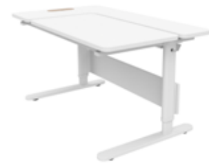
MOBY-right up 82-50148