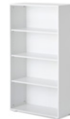
Bookcase with 3 shelves H:135,2 W:72 D:34,5