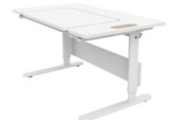
MOBY-front up 82-50150