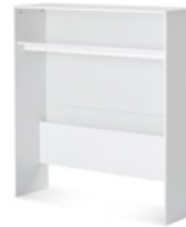
Low Hutch H:135,5 W:125,2 D:34,5

Cabby is a modular storage system made of high-quality MDF. With its timeless design and great functionality Cabby is perfect for creating an ideal study environment.